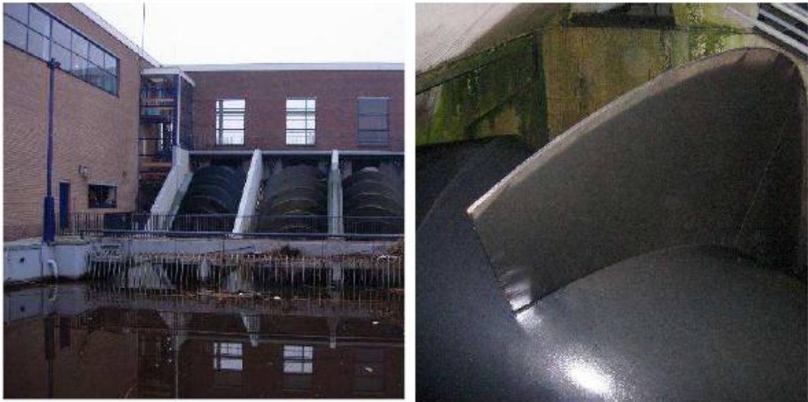
Figure 2.1 Example of a conventional screw pump with on the right side a detail of the vane

Most Dutch screw pumps are designed as open screws. The screw rotates in a concrete or metal drain, the trough. Although for an optimal return the screw should touch to the trough as much as possible, there is always water flowing between the screw and trough. Figure 2.1 shows an conventional screw pump, even as a detail of the start of a vain.