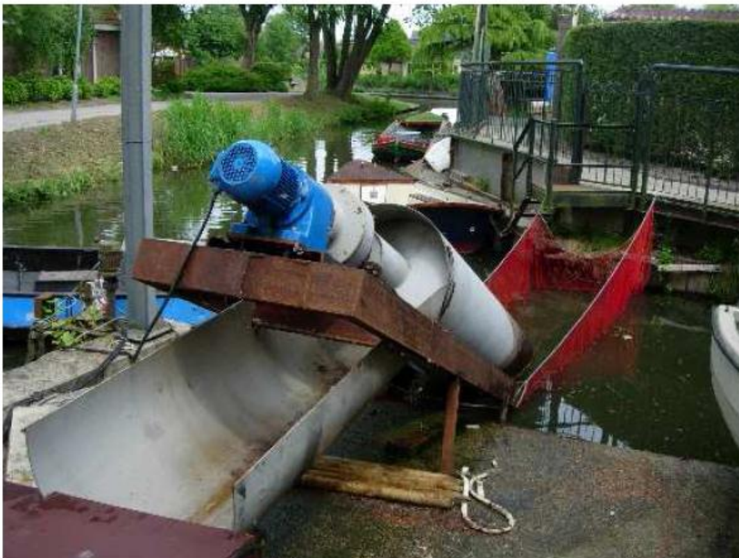
Figure 3.2 Net construction for supply of fish to the screw pump