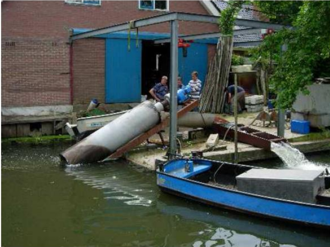
Figure 3.1 Test set up with screw pump