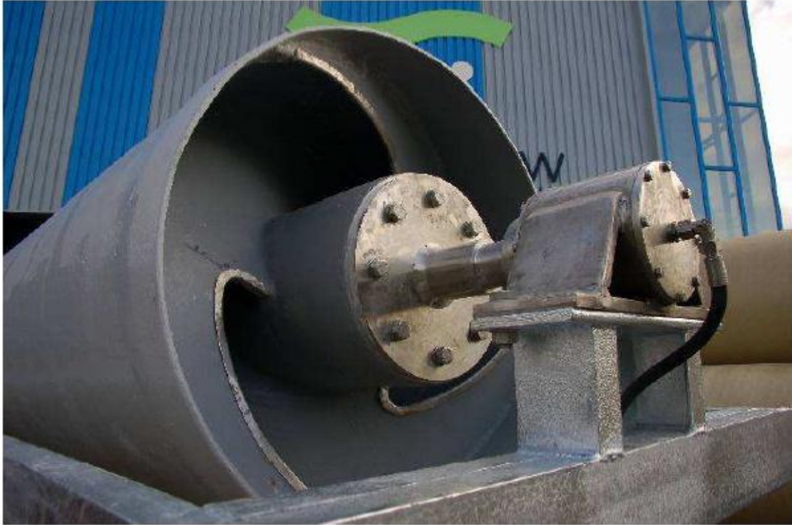
Figure 2.2 Screw pump of FishFlow Innovations