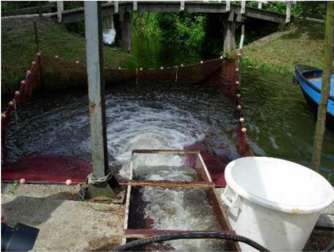
Figure 3.3 Netconstruction for collection of the pumped fish